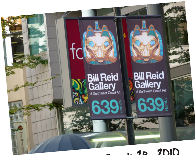
Picture taken on Sept 28, 2010 (almost 2 years after they were installed)

After 22 months, the banners look almost new. Municipalities and BIAs can “Go Green” without compromising quality or paying too much. It’s a win-win, for you - and for the environment!